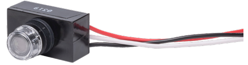
PHOTO ELECTRIC SWITCH 120V WALL MOUNT MINI